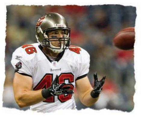
65 TRUEBLOOD OT